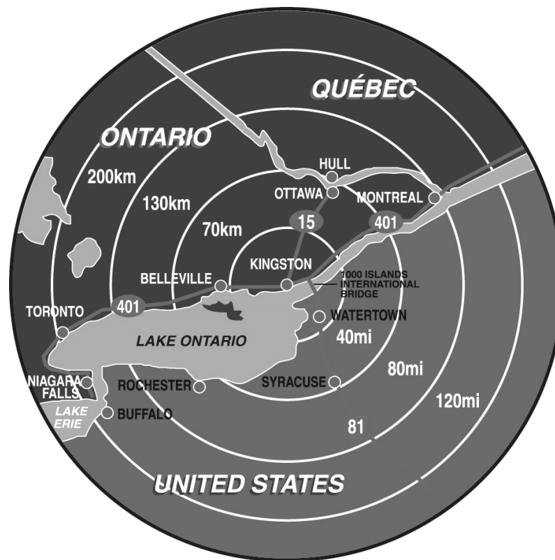
Figure 1. Location map, Kingston, Ontario

The empirical data presented were collected from students studying at Queen’s University - a highly selective, research-intensive university - located in the mid-sized city of Kingston in eastern Ontario (see Fig. 1). The findings of this study have implications for university administrators, economic developers, and urban planners across Canada.